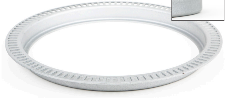
Part No. 434 0579 10 fits the wheel hub of the new design

With DAF, two different wheel hubs are used where the wheel bearing unit (RIU) with Part No. 566283.01.H195 can be installed.