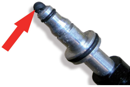
Image 4: If the old seal is not removed, it can get pressed into the CSC and block the tube

The system must be bled when the CSC is replaced. The procedure for doing so is split into two separate steps: bleeding the clutch and bleeding the CSC.