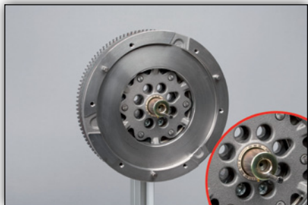
Image 4: Fit the centering sleeve before assembling the clutch (watch out for the fitted screw).