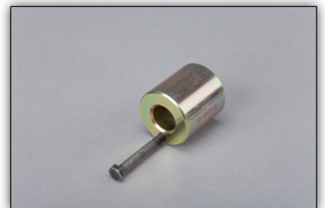
Image 3: The centering sleeve (400 0076 10) must only be used on dual mass flywheels with pilot pins.

Any reference to replacement part numbers for vehicle manufacturers is for comparison purposes only.