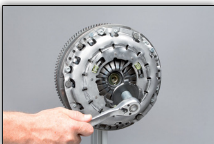
Image 8: Unscrew locking element with appropriate tool and remove. This is no longer required.