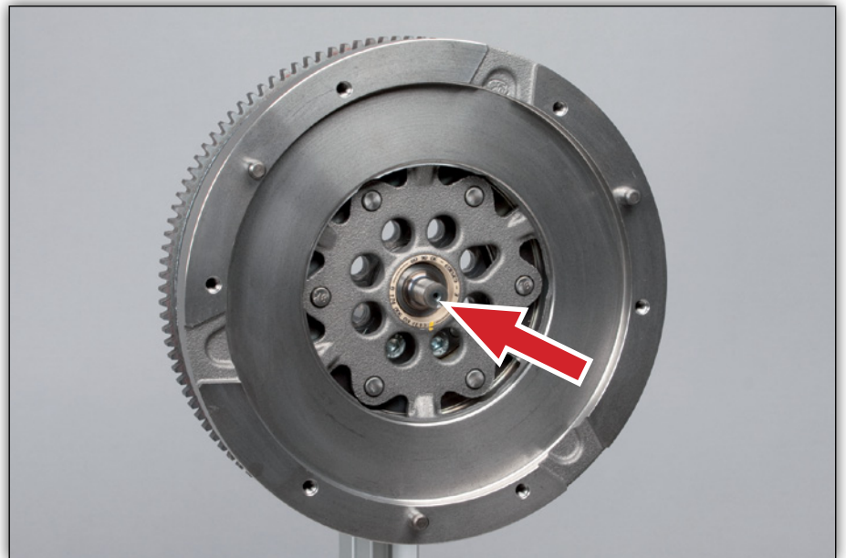
Image 1: Pilot pin on DMF 415 0377 10

415 0377 10 (DMF) 400 0076 10 (centering sleeve)