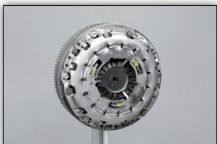
Image 7: Attach the clutch pressure plate and tighten the screws evenly and sequentially using the torque prescribed by the vehicle manufacturer.