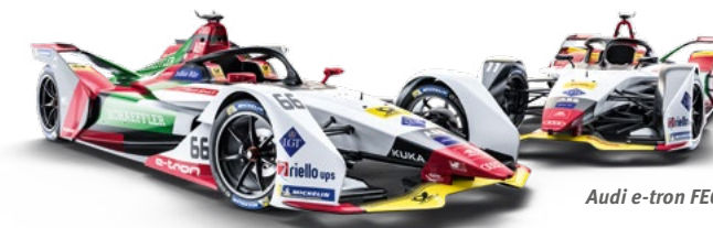
Audi e-tron FE05

Point system 1 25 pts. 2 18 pts. 3 15 pts. 4 12 pts. 5 10 pts. 6 8 pts. 7 6 pts. 8 4 pts. 9 2 pts. 10 1 pt.